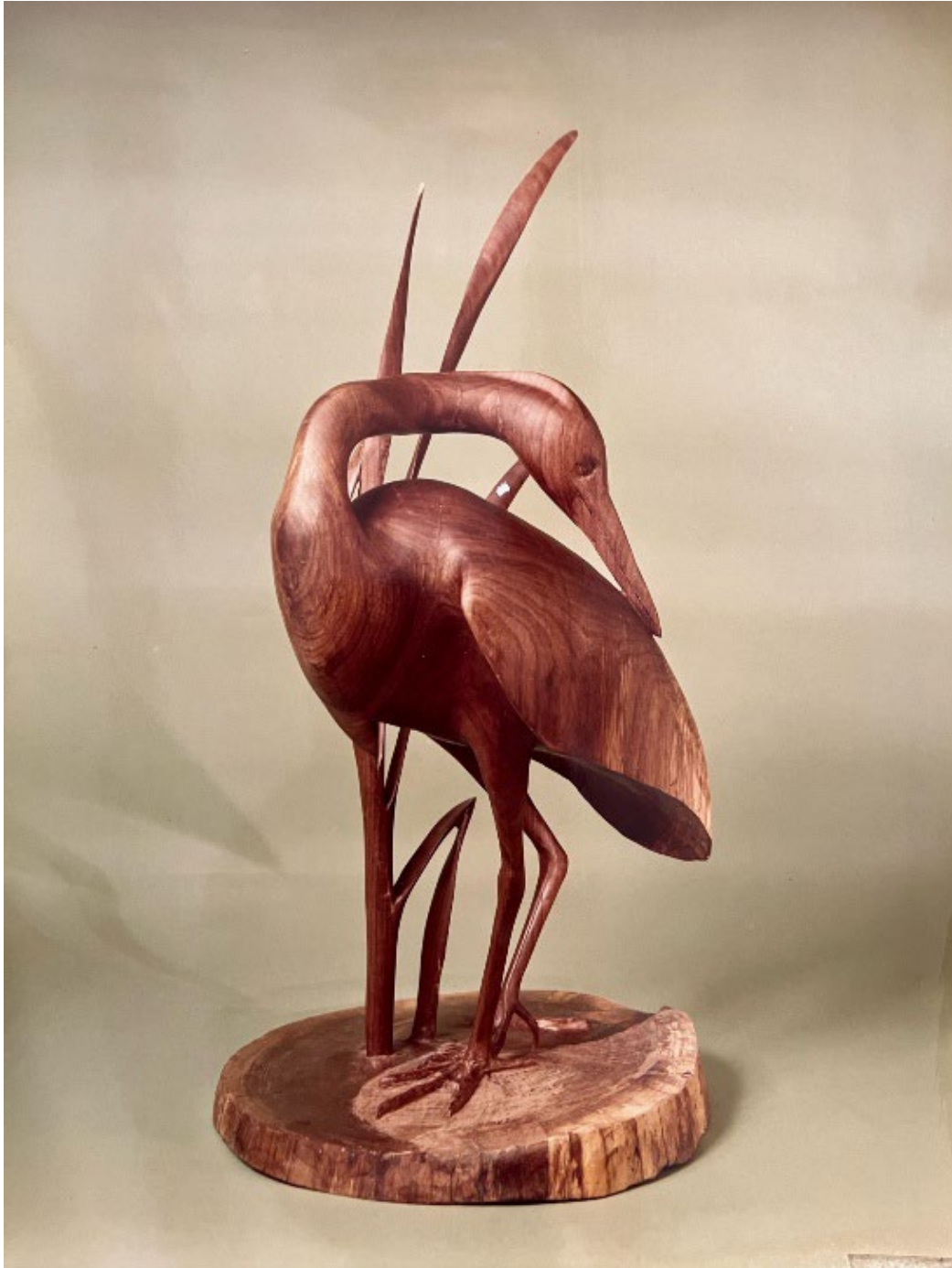
U64 Gray Heron, Black Walnut (Tom Jones Photo).