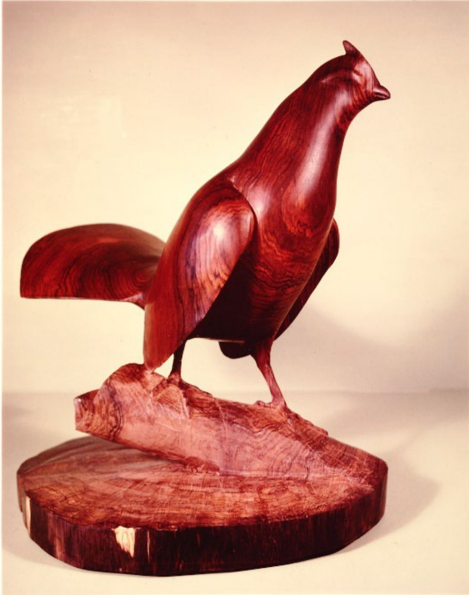
U63 Ruffed Grouse, Brazilian Rosewood, March 1969 (Tom Jones photo).