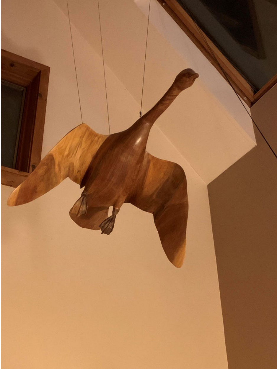
U55 Canada Goose, Black Walnut, probably 1965-1966.