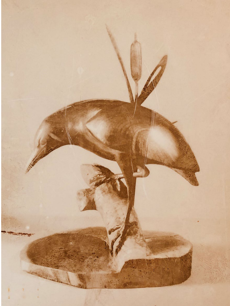
U79 Black-crowned Night Heron, Black Walnut. Photo indicates a sculpture in the 1950s or early 1960s.