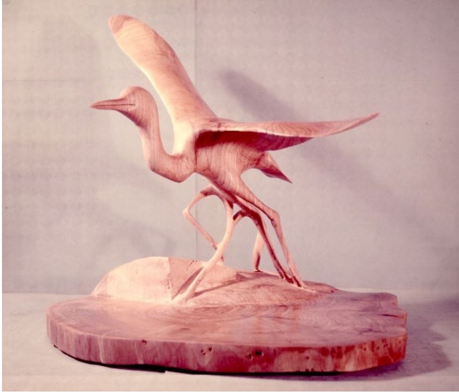
U62 Great Blue Heron (Tom Jones photo).