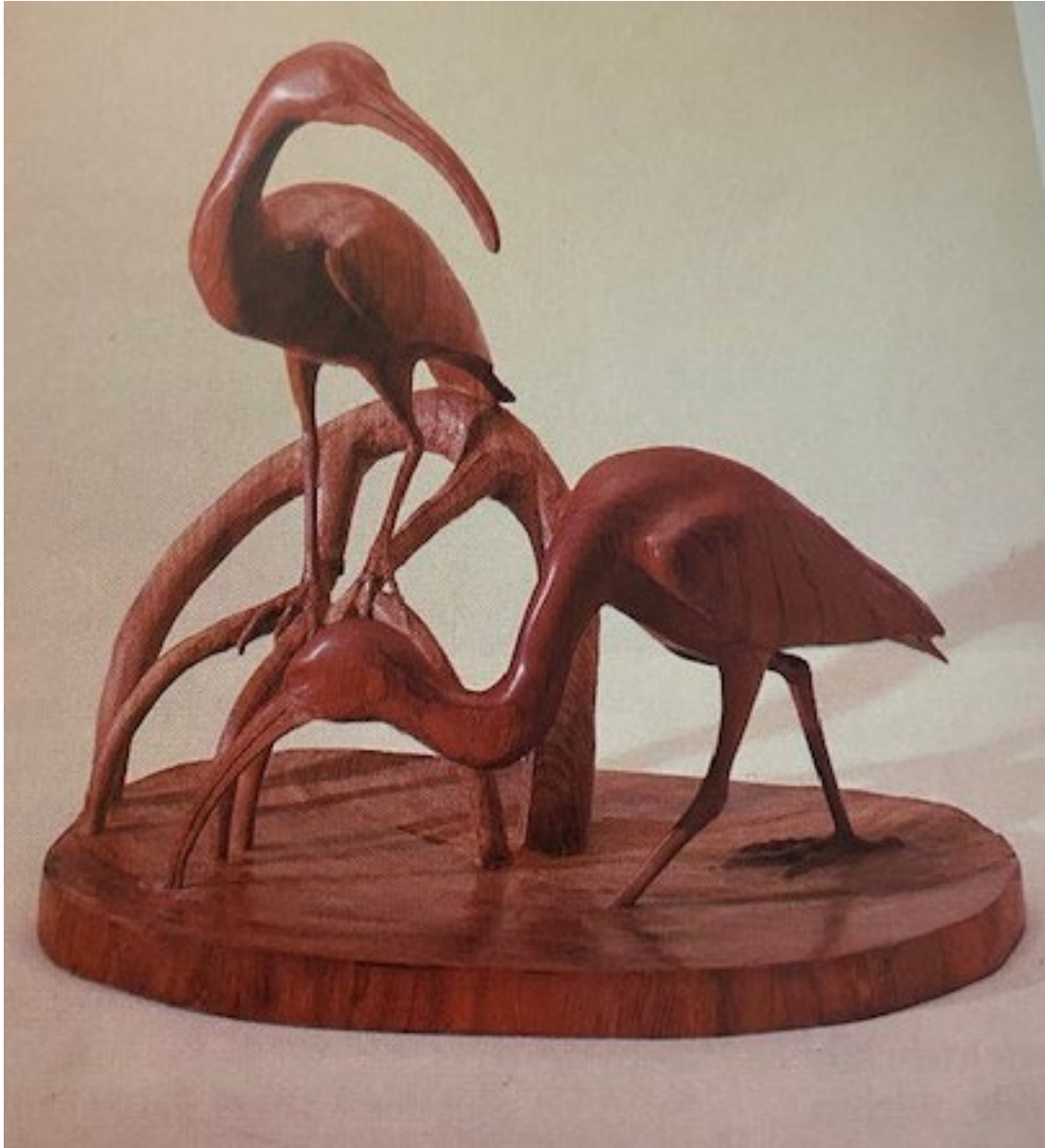
U71 Glossy Ibis Pair, Bubinga, 1980 Birds in Art.