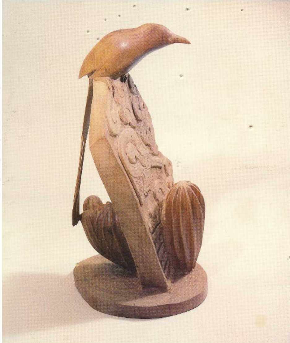
TURQUOIS-BROWED MOT-MOT (Yellow Ebony - Eugenia)