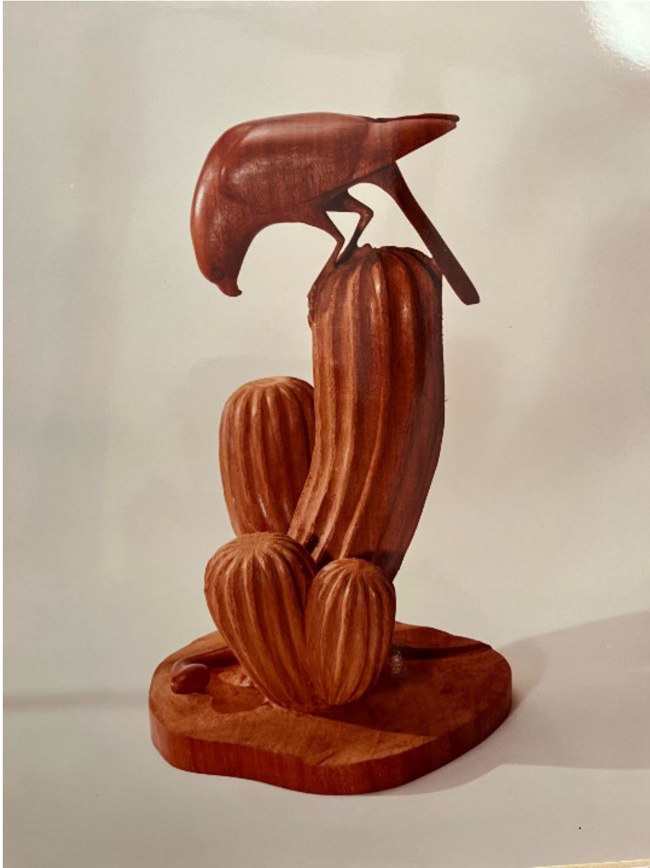
U74 Hawk on Cactus.