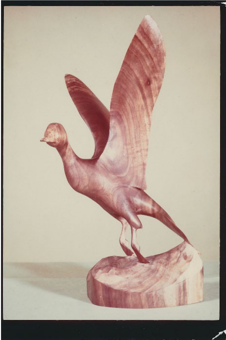
U61 Duck, Black Walnut.