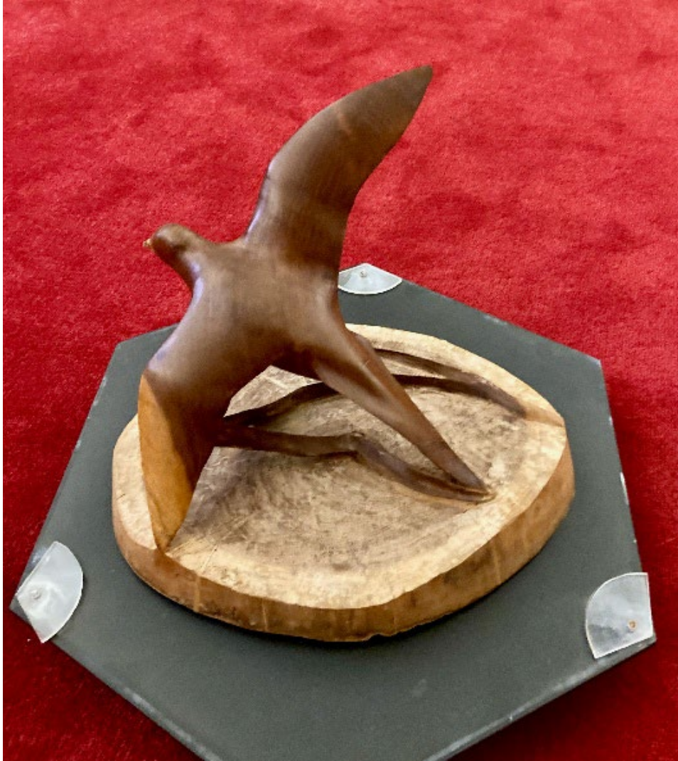
U70 Dove, Black Walnut.