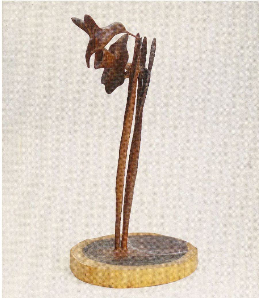
RUBY-THROATED HUMMINGBIRD (Lignum Vitae)