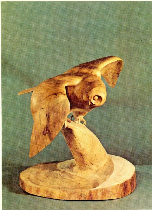
Snowy Owl Elm