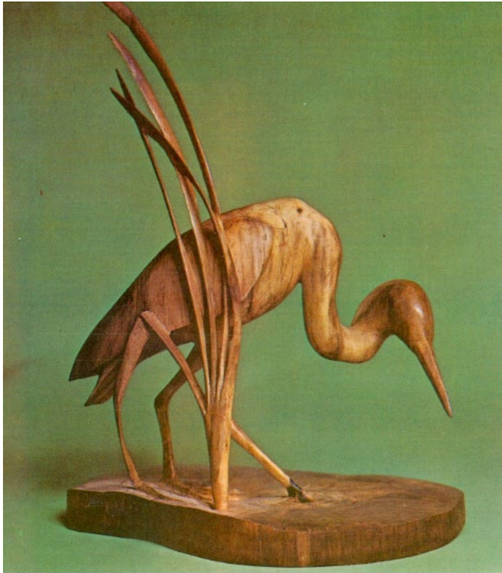
SNOWY EGRET ( Persimmon )