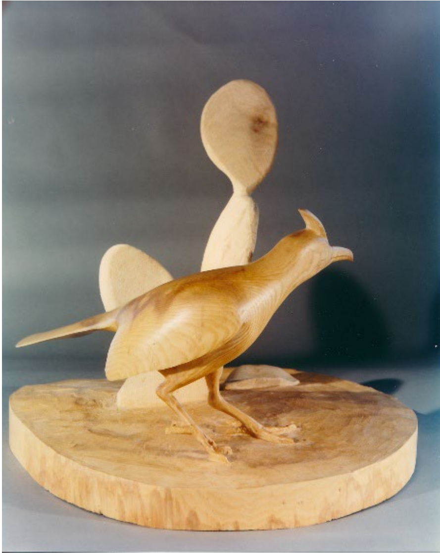
U56 Road Runner and Cactus.