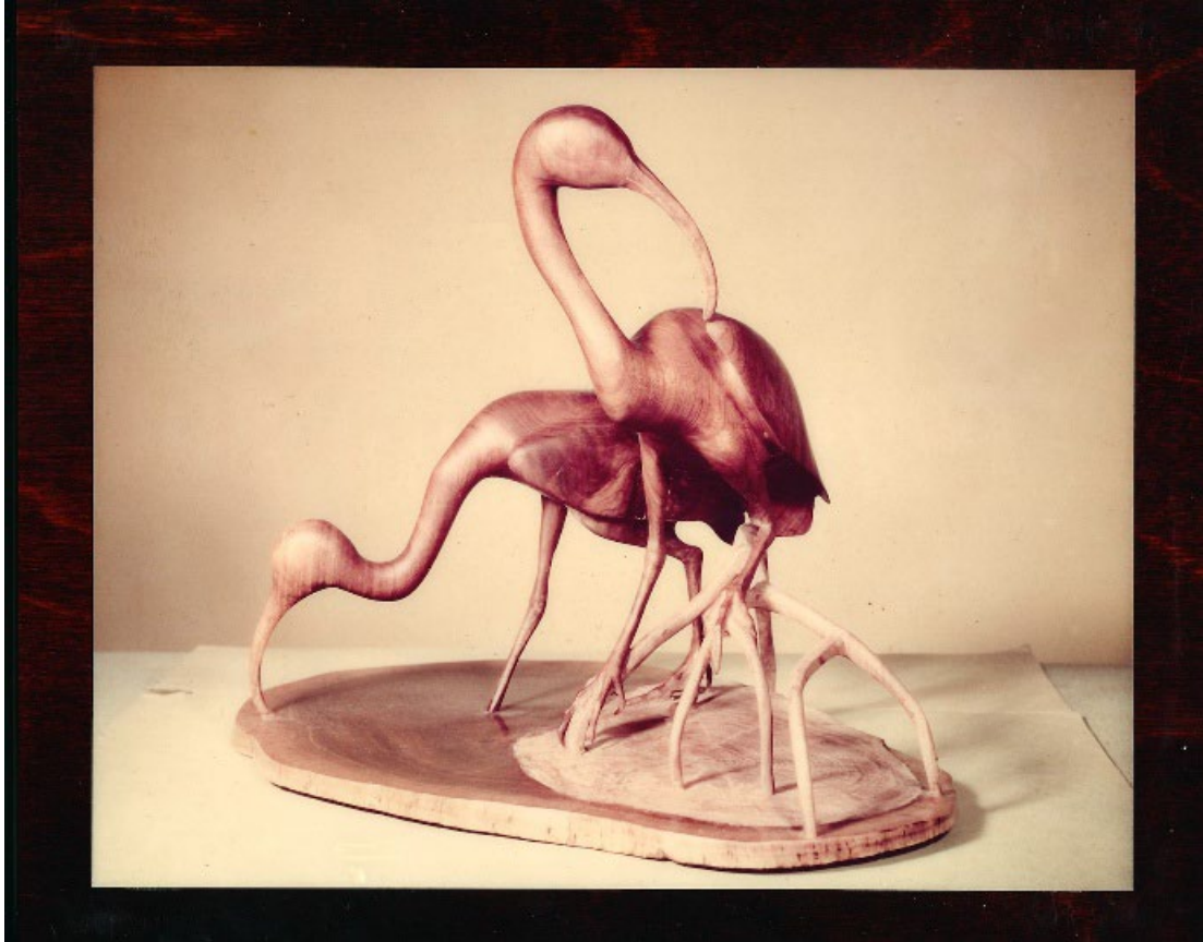
U61 Glossy Ibis Pair, Black Walnut.