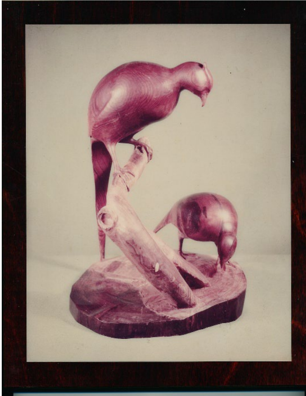
U60 Pheasant Pair, Brazilian Rosewood.