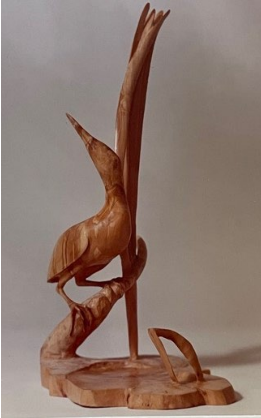
U57 Green Heron, Olive Wood.