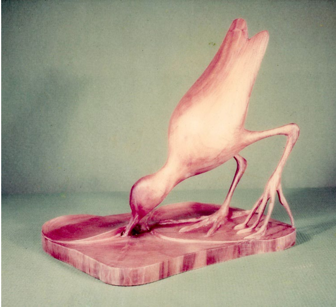
U52 African Jacana, Probably 1964 after Chippy's 1963 trip to Africa (Tom Jones photo).