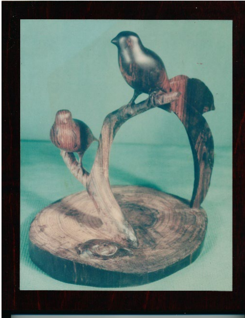
U54 Quetzal, Brazilian Rosewood.