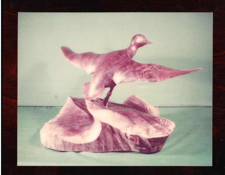
U52 Black Duck, Black Walnut.