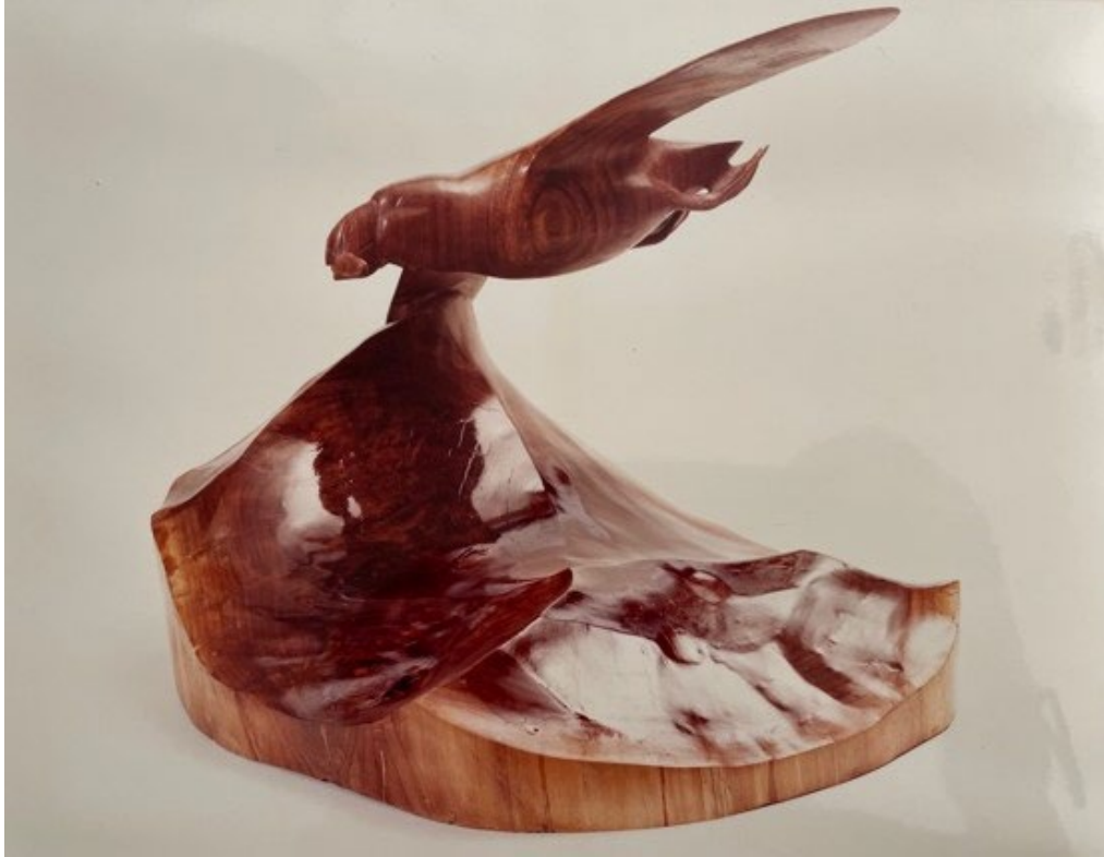
U73 Puffin, Black Walnut.